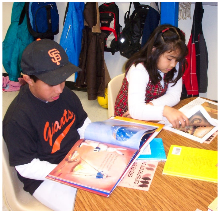
Benefits of learning to read pays off in other academic areas including writing, grammar, and comprehension.

Overall, reading growth for the group was .74 grade level with a slightly higher average, .80 for students who attended at least one full session of tutoring. Even for students who did not complete a full session of tu-