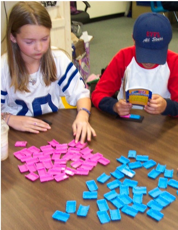
Word games, such as this one being played, are part of helping students learn and increase self-esteem about their reading ability.