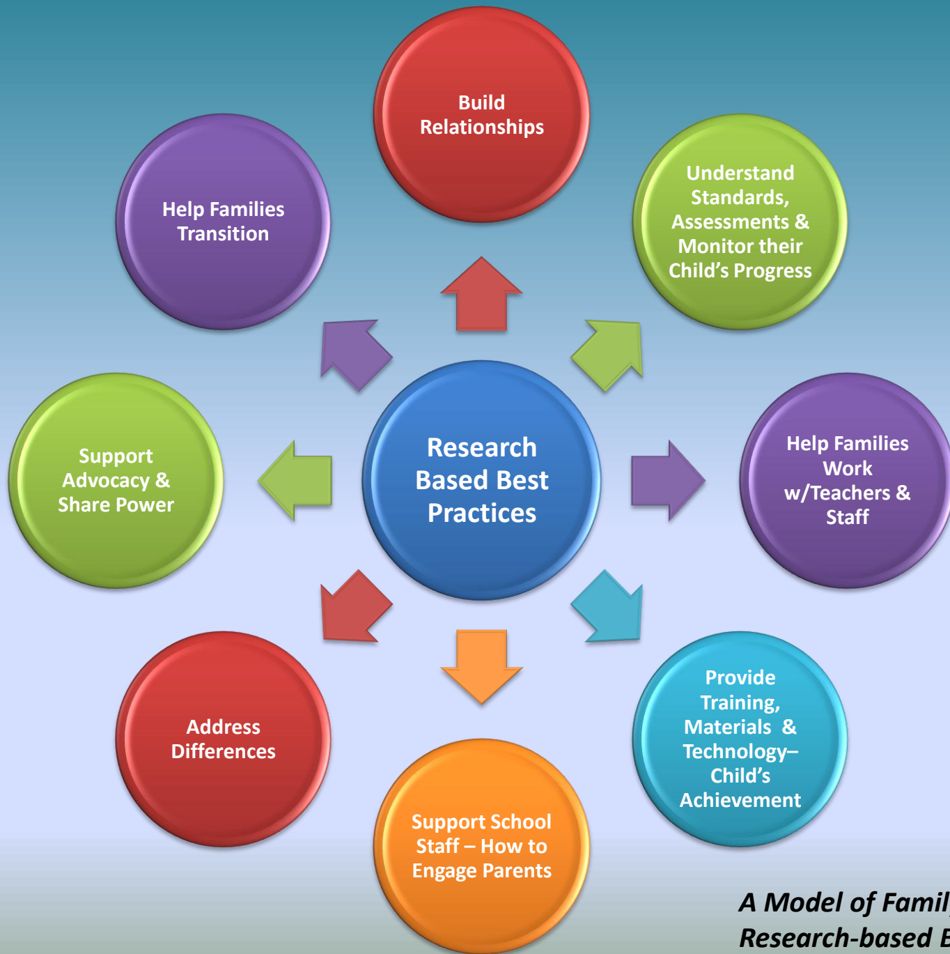
A Model of Family Engagement Research-based Best Practices